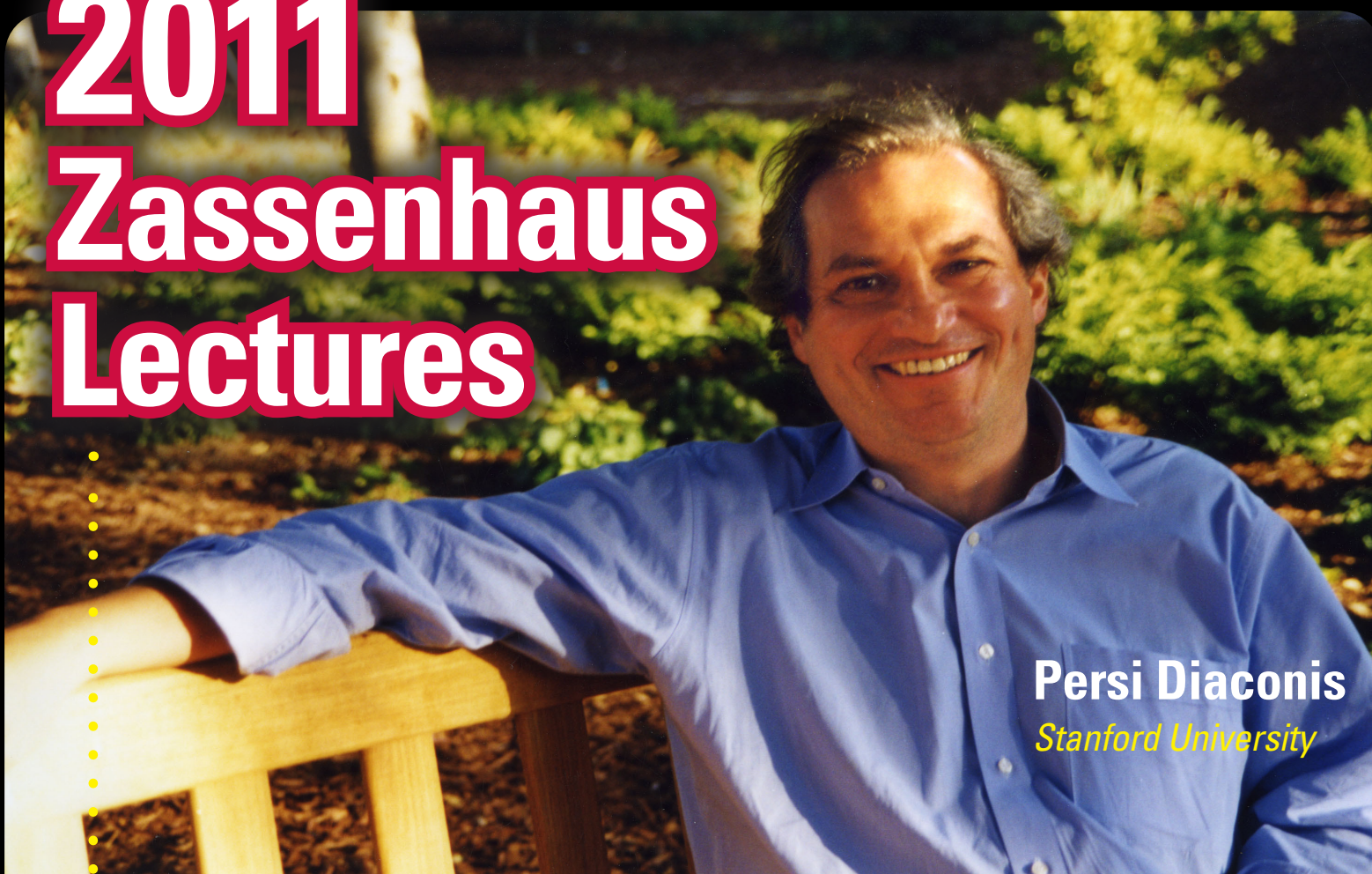
Persi Diaconis Stanford University