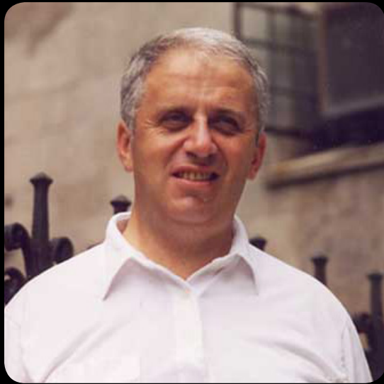
Gregory Margulis Yale University